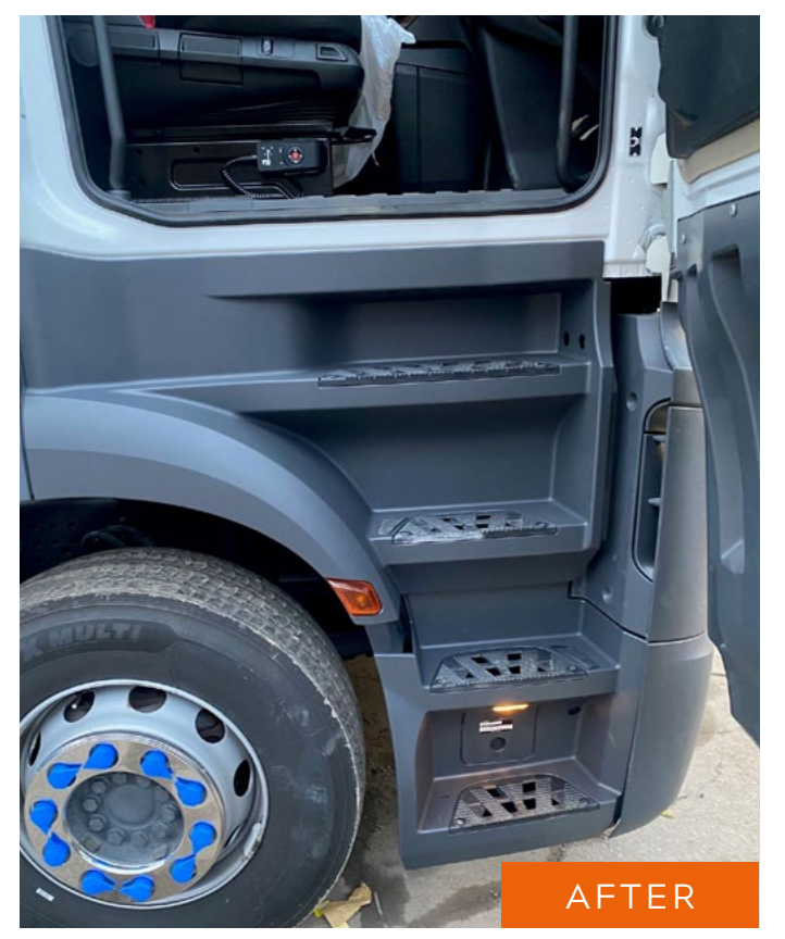
3. Final Touches: After completing the repairs, the vehicle was primed and painted, ensuring that the vehicle was aesthetically pleasing and ready for use.